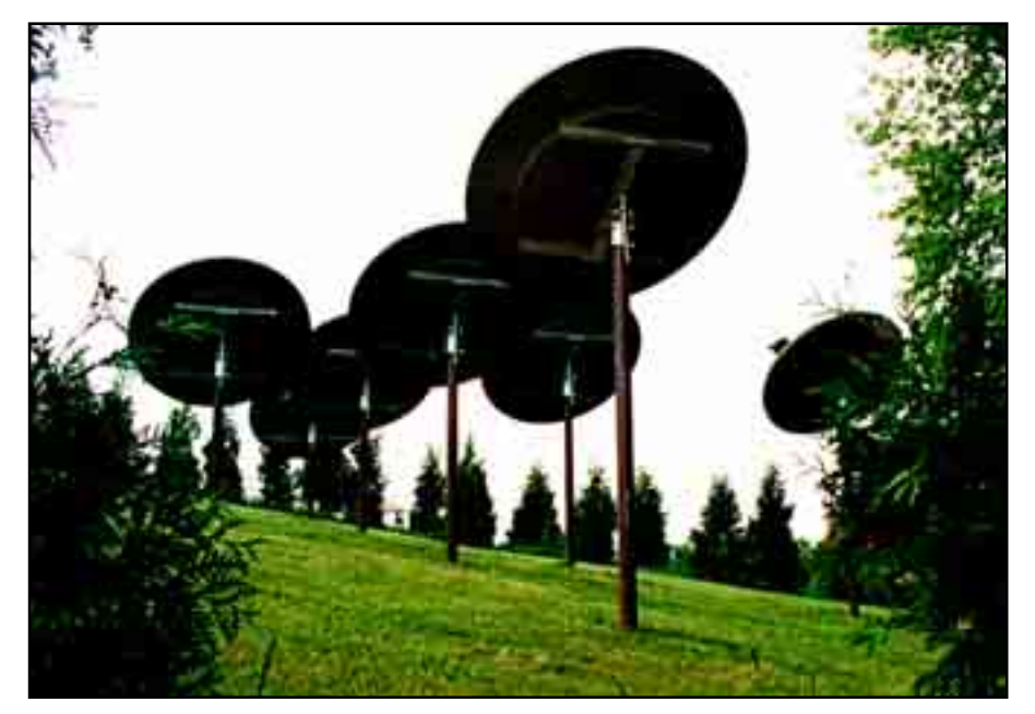
Masts are set on concrete blocks in each hole, with reinforcing bar to prevent twisting (see text).

Once the Very Small Array becomes operational, I hope its success will enable the grassroots SETI League to attract major corporate funding for its much more complex Array2k , a massive radio telescope array first contemplated in 1999. The bargain-basement VSA will be used to test engineering concepts for the planned $250,000 Array2k , which is itself a hundred times cheaper than conventional radio telescope designs. Thus, we hope to help bring radio astronomy and SETI