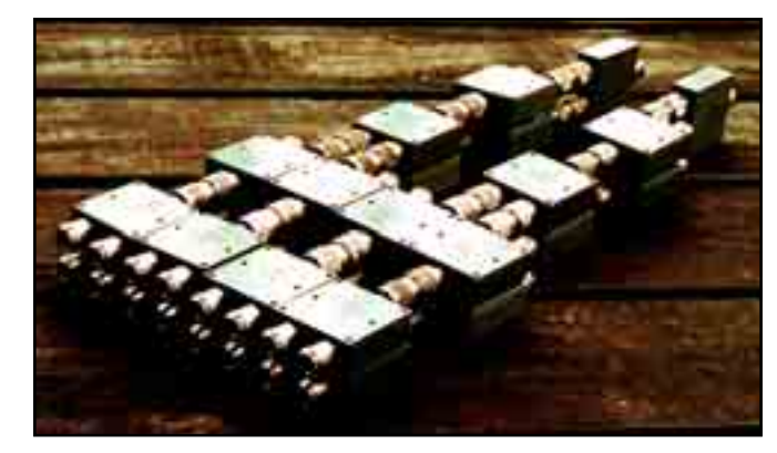
The VSA phasing matrix. These bias Ts and power dividers/combiners will produce four different beam patterns simultaneously, in two orthogonal circular polarizations.

research to the masses. Already, several SETI League members in the Third World have used amateur techniques to build the first radio telescopes in their respective countries. But whether the VSA paves the way for more ambitious projects or not, it shows the world how donated dishes, student labor and ham ingenuity can combine to test a high-tech concept on a shoestring budget.