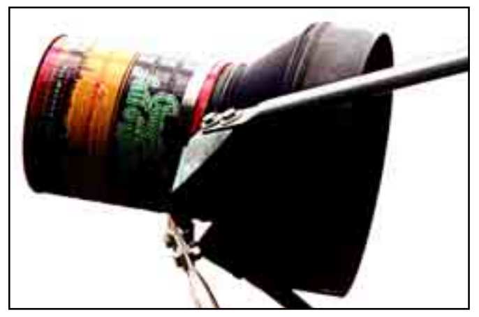
Since we intend to use the VSA at L-band, on a frequency of 1296 MHz, one can scale the dimensions of the standard C-band feed by a factor of three. As is the amateur tradition this feedhorn is constructed from low-cost materials!