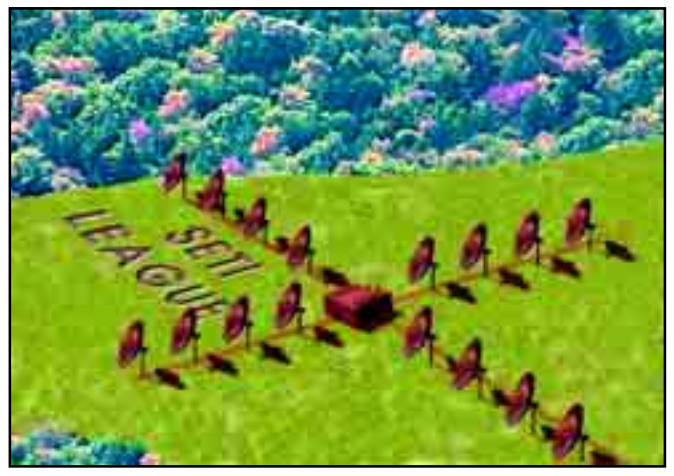
Noted space artist Jon Lomberg created this conception of Array2k , the next-generation radio telescope now in preliminary design phase at SETI League headquarters.