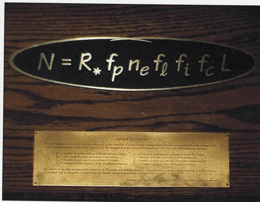
The seven agenda items for the Order of the Dolphin meeting. Strung together, they form the famous Drake Equation. This plaque graces the very wall on which the equation was originally scrawled on a chalkboard at NRAO Green Bank in 1961.

A year after Project Ozma's brief tenure, Drake convened at Green Bank