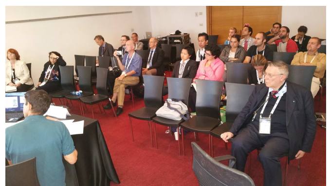
Two dozen space scientists attended the SETI and Society session at the Jerusalem IAC in October 2015.