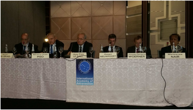
During Academy Day, the IAA Climate Change panel represented humanity as astronauts aboard a spacecraft whose life support system is malfunctioning.