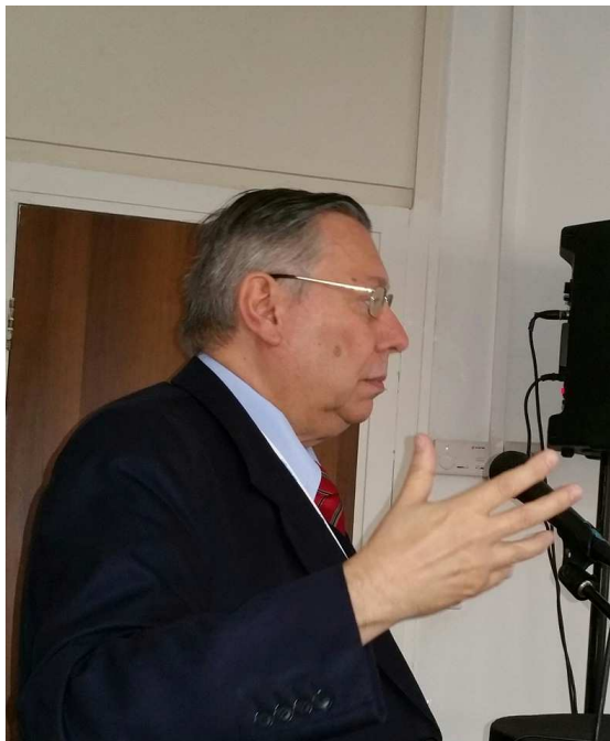
Italian mathematician Claudio Maccone discusses the use of the realistic KLT to detect transient signals from theorized extraterrestrial spaceships.