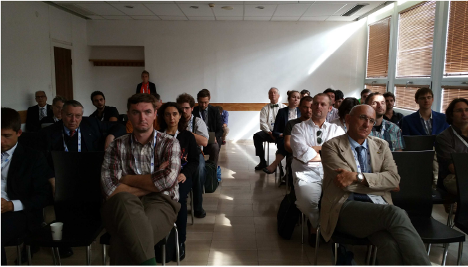
This small but intensely engaged group attended the SETI Science and Technology session at the International Astronautical Congress in Jerusalem last October.