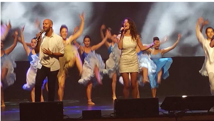
Music and dance marked the IAC Opening Ceremonies.