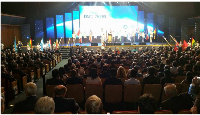
Youth carried in the flags of all participating nations to kick off Opening Ceremonies at the 66th International Astronautical Congress in Jerusalem.