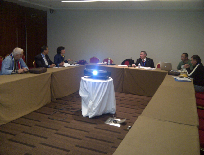
The International Academy of Astronautics SETI Committee holds regular meetings each year at the annual International Astronautical Congress.