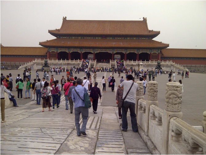
On the Sunday before the IAC began, many academicians enjoyed the opportunity to tour Beijing's Forbidden City.

These pictures were taken at the 64 th International Astronautical Congress held in Beijing, China, in September, 2013.