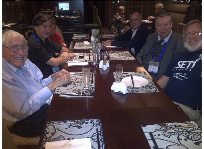
SETI enthusiasts from Italy, Netherlands, Scotland, and the US gather in China for the annual IAA SETI dinner.