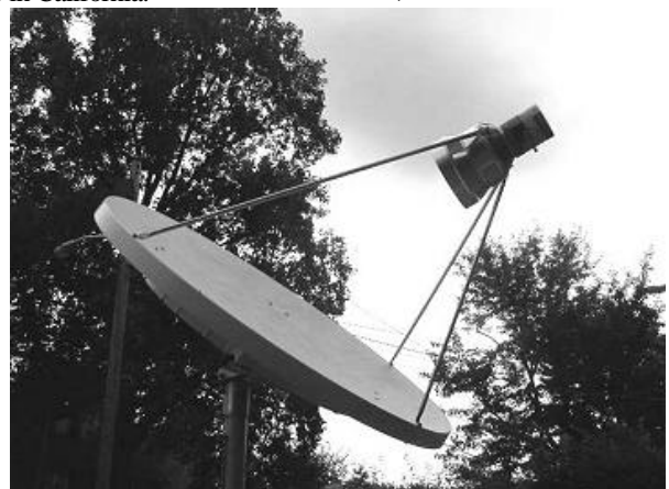
At Right: First Array2k feedhorn assembly undergoing testing at SETI League headquarters in New Jersey