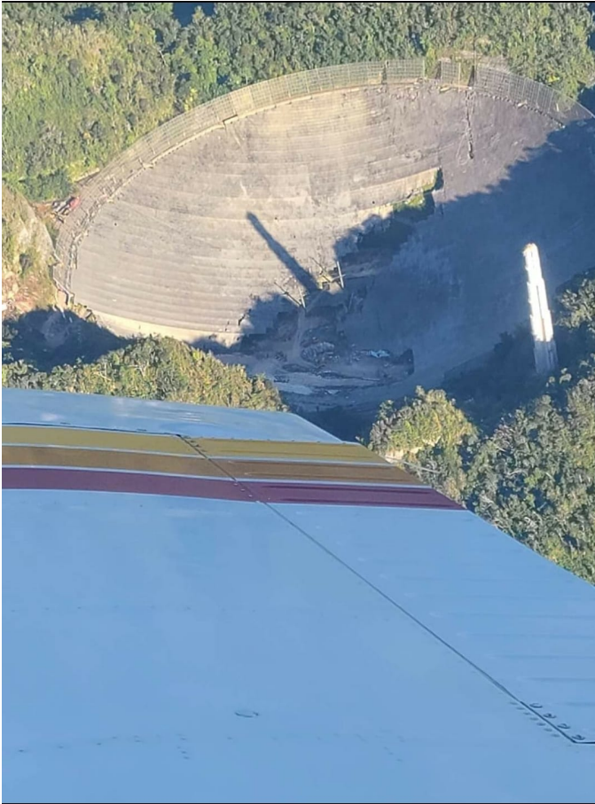
<< Eddy Cardenty took this recent aerial photo of the damaged Arecibo radio telescope from his Piper PA32.